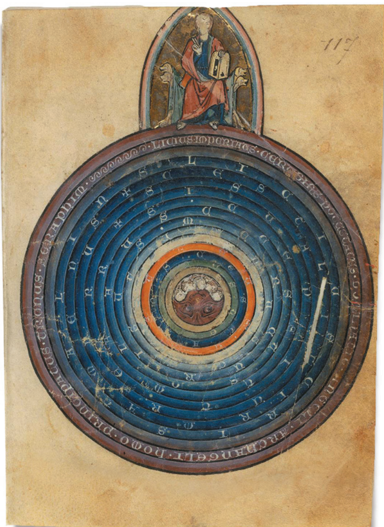
A thirteenth-century depiction of the geocentric cosmos.

L'IMAGE DU MONDE BY GOSSUIN DE METZ. BIBLIOTHÈQUE NATIONALE DE FRANCE